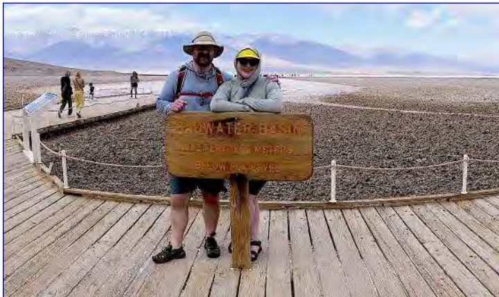
Below, Badwater Basin 282 feet below sea level are Mr. Abby and Abby.