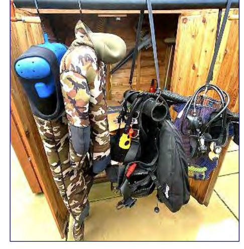
Carl's gear drip drying as no one took a group photo from the cold January 13, S3 dive.

sheets pretty early on a cold and chilly Saturday morning; drag oneself into the freezing vehicle and make the 1-2 hours trek down south without even knowing whether a dive is possible at all because of the winter stormy conditions that we have been experiencing lately.