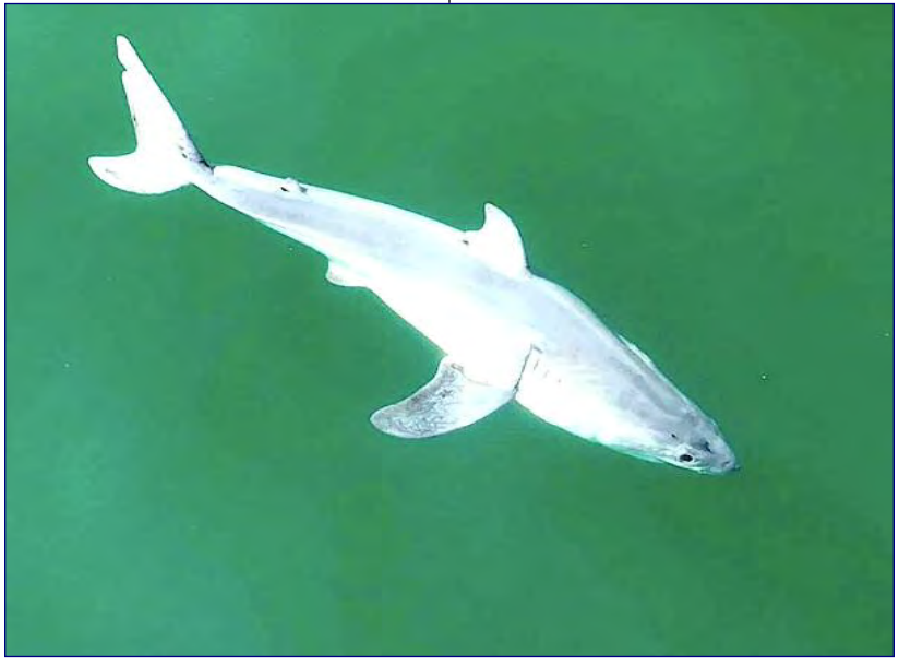
Side view of the newborn great white shark.

feet from the beach — is significant because its age means it was likely born in shallow waters. Great whites are listed as an international endangered species. "Further research is needed to confirm these waters are indeed a great white breeding ground. But if it does, we would want lawmakers to step in and protect these waters to help white sharks keep thriving," Sternes said.