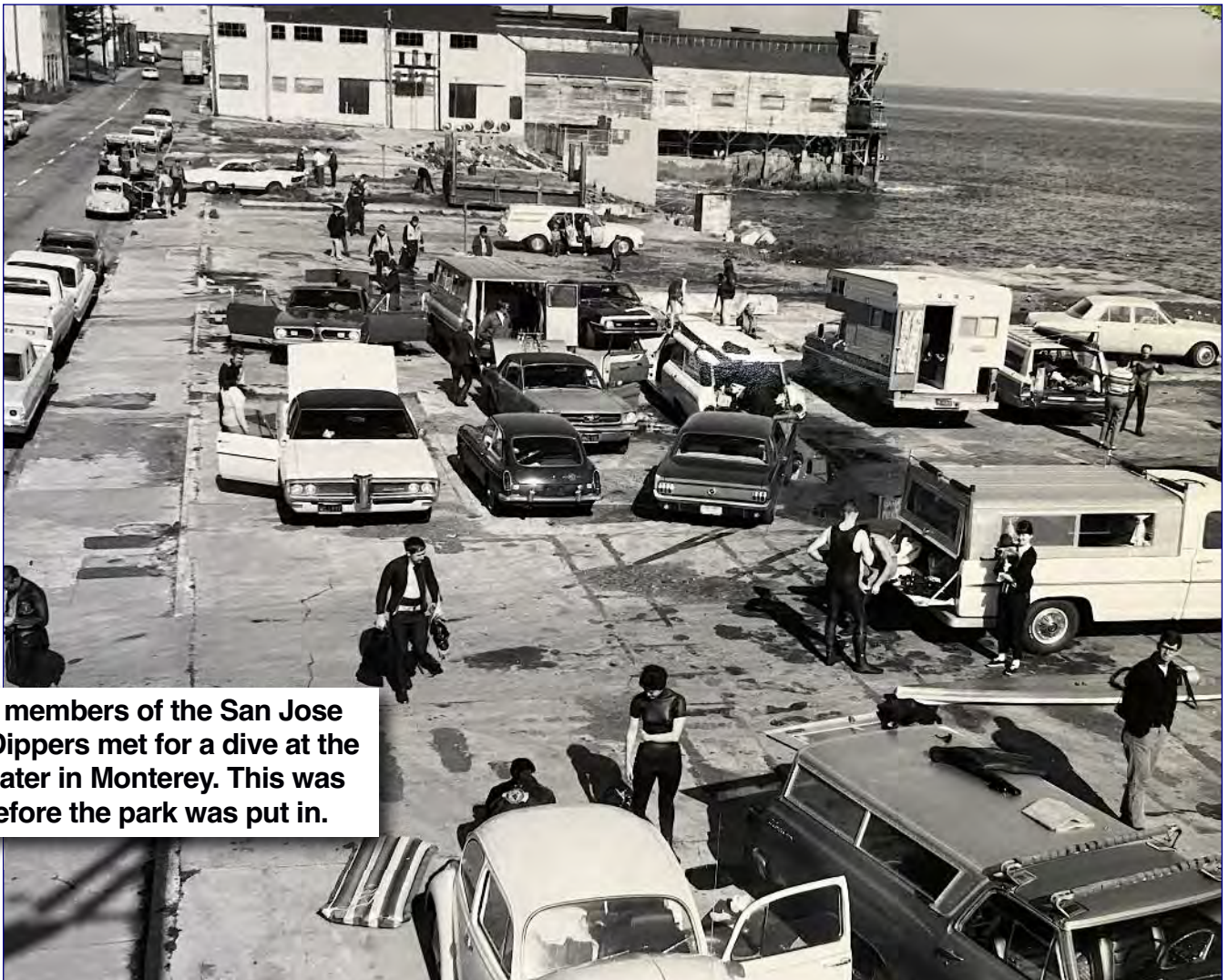
In 1969 members of the San Jose Flipper Dippers met for a dive at the Breakwater in Monterey. This was well before the park was put in.