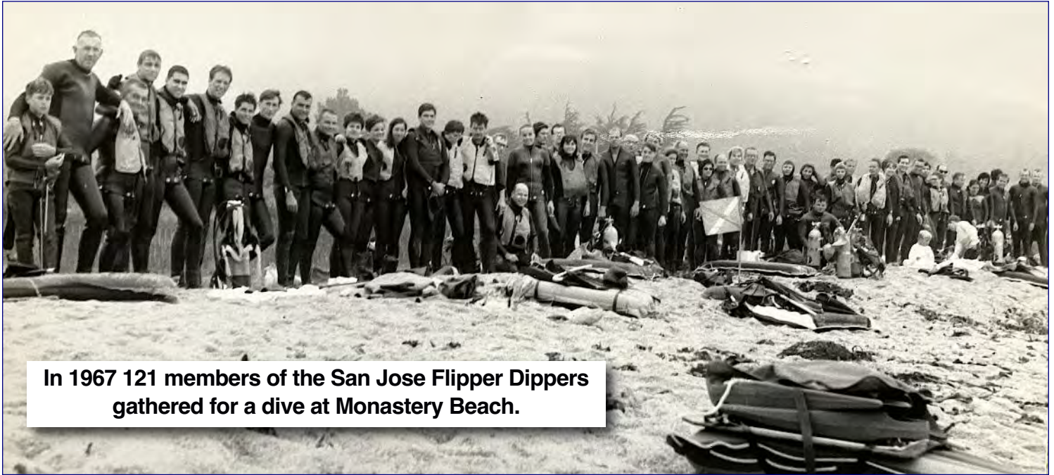
In 1967 121 members of the San Jose Flipper Dippers gathered for a dive at Monastery Beach.

The San Jose Flipper Dippers celebrate 59 years this month. Below are some photos from those early years.