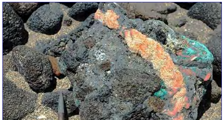
Rocks Made of Plastic Found on Hawaiian Beach