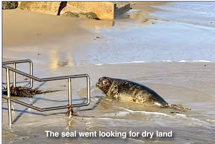
The seal went looking for dry land