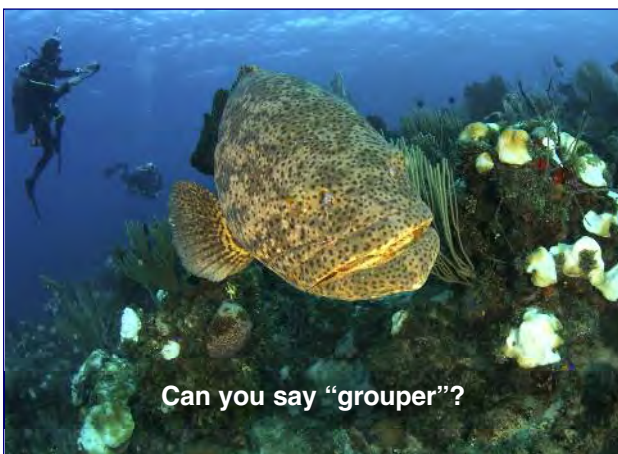
Can you say "grouper"?