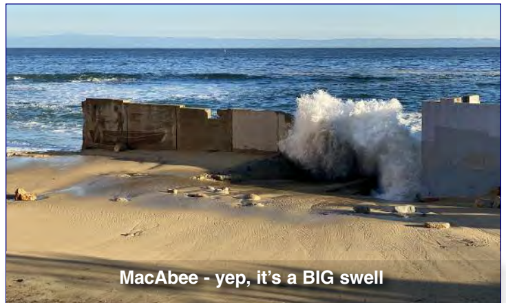
MacAbee - yep, it's a BIG swell