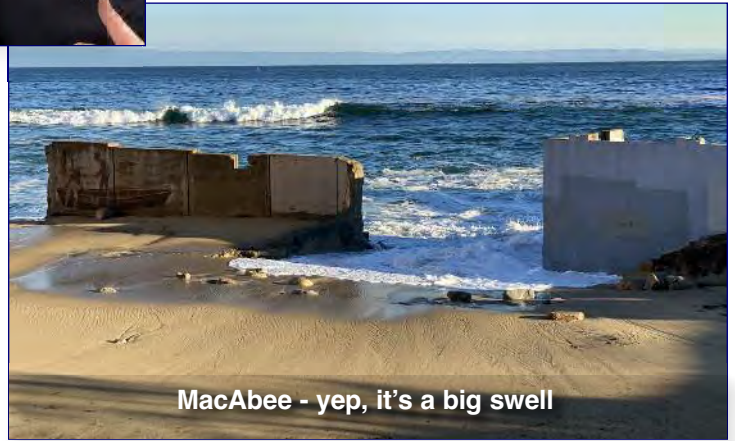
MacAbee - yep, it's a big swell