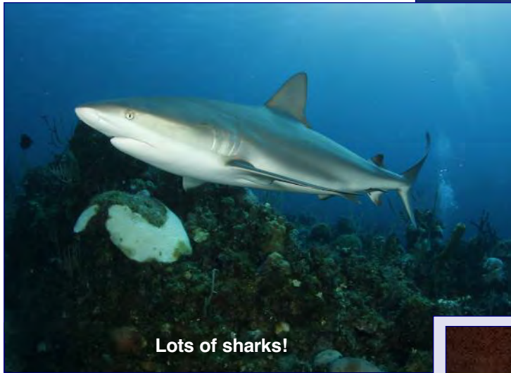
Lots of sharks!