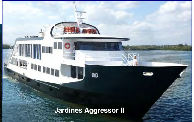
Jardines Aggressor II