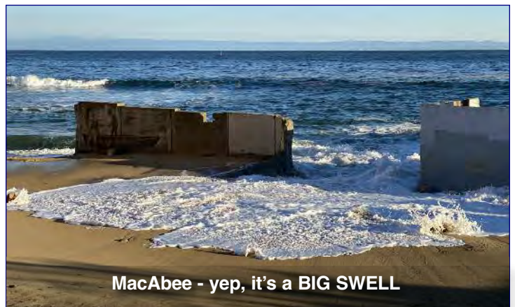
MacAbee - yep, it's a BIG SWELL