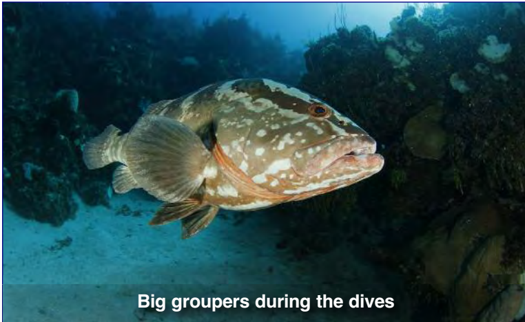
Big groupers during the dives