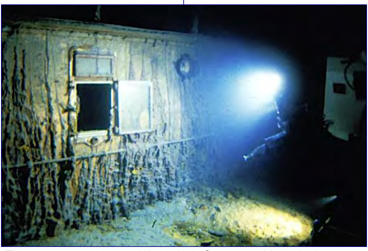
This image shows the deck of the Titanic 12,500 feet (3.8 kilometers) below the surface.