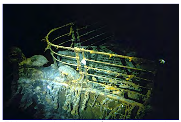
This image provided by the Woods Hole Oceanographic Institution shows the bow of the Titanic 12,500 feet (3.8 kilometers) below the surface.

He said: "I think everyone wonders in their own mind 'If I were there, what would I have done?" " ❖