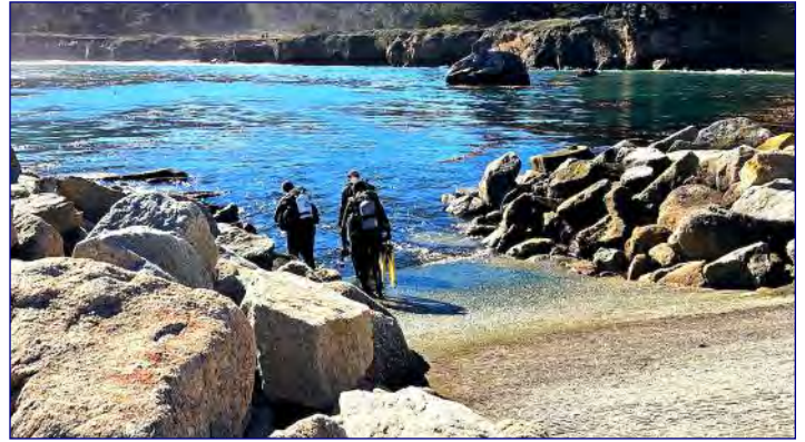
Pt. Lobos was calling. Might as well go diving!

We did one dive along the pipe to the metridiums (this time a huge lingcod was in residence at the end of the pipe) and one along the Breakwater wall to see the sea lions.