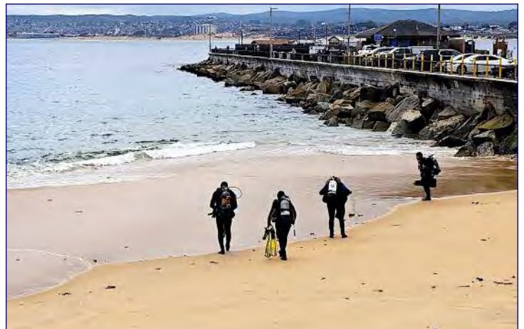
The Breakwater beckons the Dippers. Gee, it's . . . not crowded at all!

And the moral of this story: You should have gone diving! ★