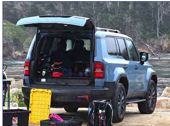
Ken's new vehicle was christened and has lots of room for dive gear at Pt. Lobos!

that 'right' was the right direction, so I just followed him. We were a little lost, but all in all, we ended up back in the cove. There was tremendous amount of kelp in the cove so it took tremendous efforts to surface crawl back to the ramp. We were cold and decided that one dive was just perfect for us. We called it a day and headed home, early enough to get back to the Bay Area for lunch. ★